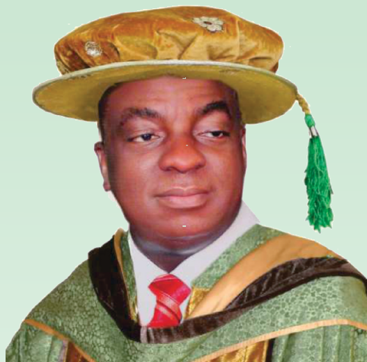
DR. DAVID O. OYEDEPO CHANCELLOR & CHAIRMAN, BOARD OF REGENTS, LANDMARK UNIVERSITY

Landmark University is a crucible for raising reformers where we empower destinies, offering unlimited opportunities, and breaking new grounds. Our mandate is to raise a new generation of leaders who will restore the dignity of our great nation and the dignity of the black race.